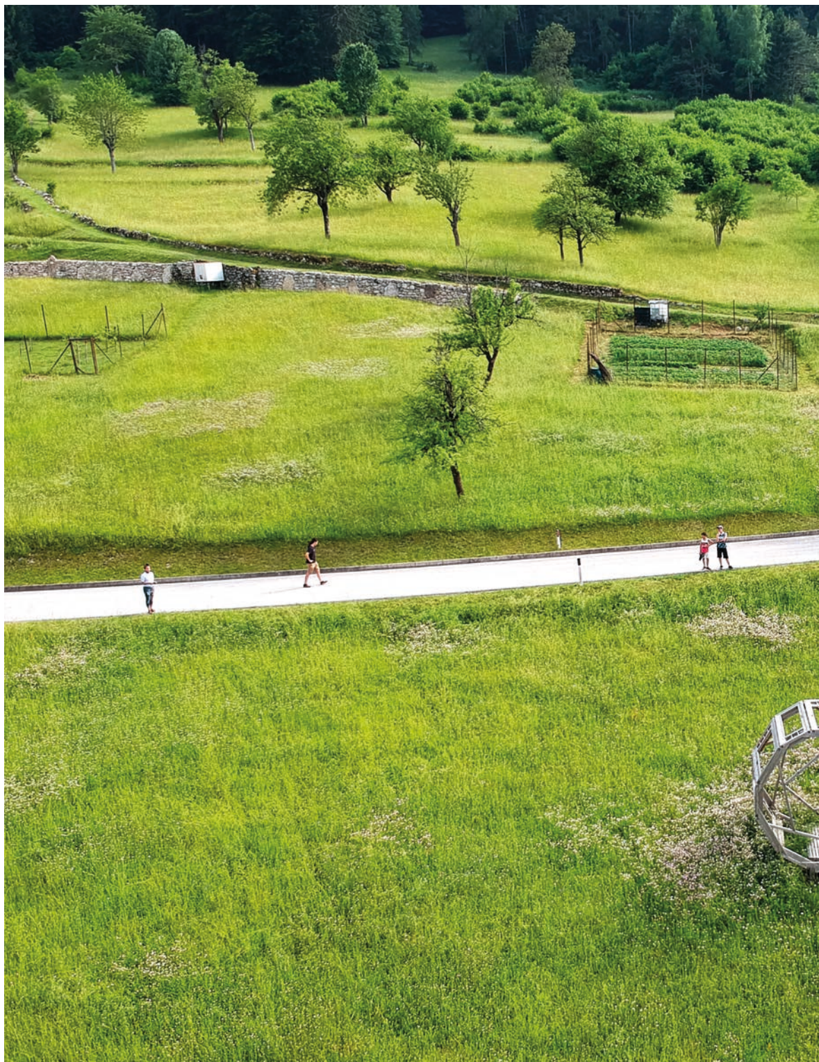
Fig. 5 – The wheel is thought of as an artistic installation but also as a lens to experiences through the landscape, Camposaz 2019.