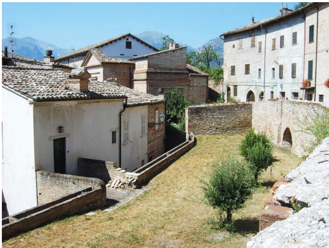
Fig. 1 – Terraced landscapes in the historical centre of Amandola (FM), Photo M. Ferretti, 2018.