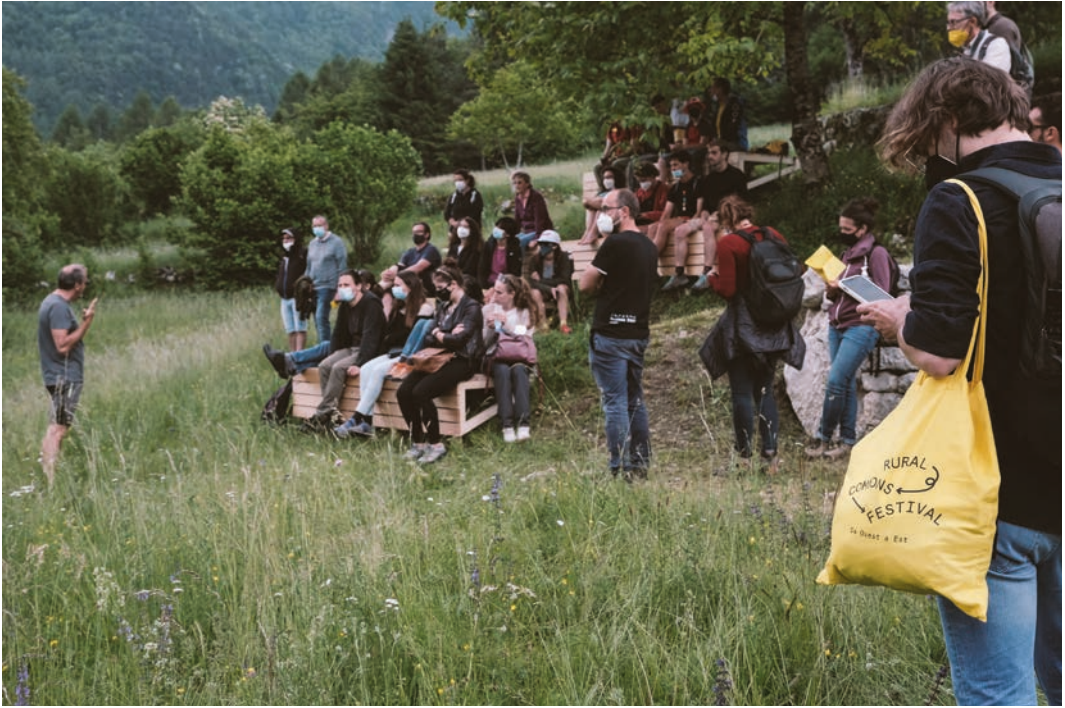
Fig. 6 – The Parliament of the Community by Camposaz in the terraced landscape of Geroli during the Rural Commons Festival.

novative regeneration, transformation, and adaptation strategies. The importance of considering the spatial resource in the definition of commons is quite evident, as space is where new actions can happen. At the same time, landscape design is also a crucial player not only for its inventive capacity, but also as it can direct the strategic and operative goals of these contexts. Therefore, there is even more need to find new ways of production of public space, prioritizing community-led initiatives to enhance immaterial values, traditions, and identities.