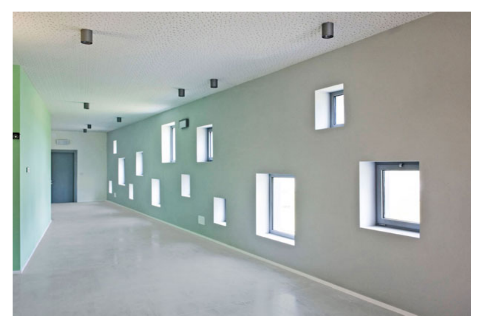
\ \uparrow The windows in the trapezoidal plaza are set at different heights to allow everyone to look out at the playground.