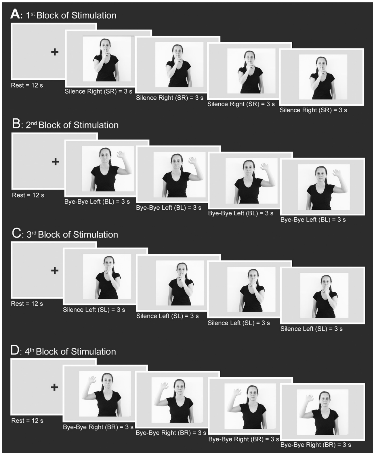
Figure 1. Functional MRI design. The functional design consisted of 2 identical runs composed of 13 resting periods alternating with 12 stimulation periods (blocks). The stimulation blocks were presented in the following order: 1. silence gesture executed by the model with her right limb (SR; A); 2. bye-bye gesture executed by the model with her left limb (BL; B); 3. silence gesture executed by the model with her left limb (SL; C); 4. bye-bye gesture executed by the model with her right limb (BR; D). During each stimulation block each image was flashed 4 times for 3 s. Blocks were not randomized