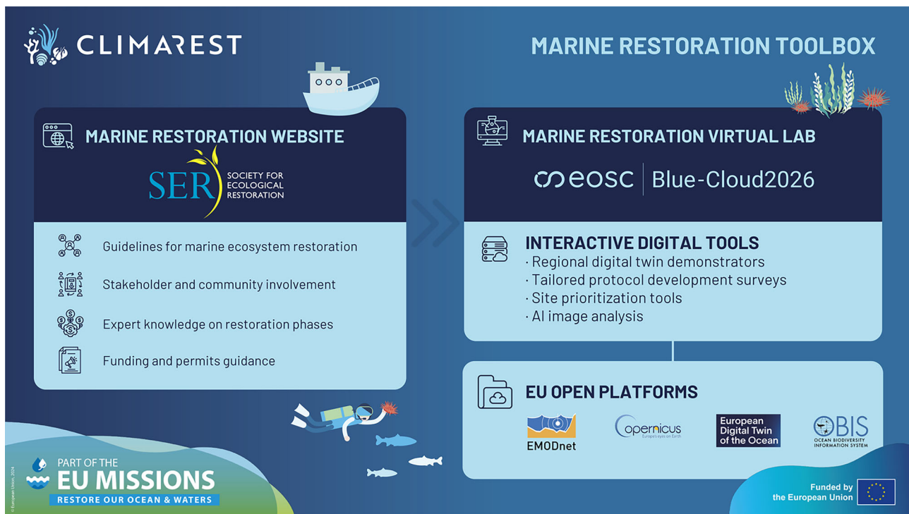
Fig. 1 Overview of the marine restoration toolbox. The toolbox includes a website that links users to relevant resources and to the marine restoration themed virtual lab where a curated demonstration cases and tools are available with associated code, data, and computational resources