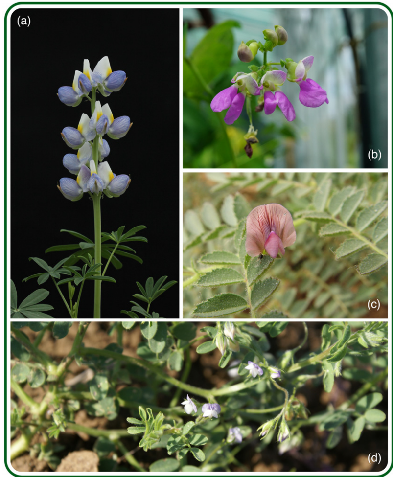
Figure 1. Flowers of the four INCREASE legume species. (a) Lupin ( Lupinus mutabilis Sweet). (b) Common bean ( Phaseolus vulgaris L.). (c) Chickpea ( Cicer arietinum L.). (d) Lentil ( Lens culinaris Medik.).

heterogeneous, which impedes the projection of the phenotypic information to the genotype and vice versa ; moreover, if available, single-nucleotide polymorphism data are mapped to a single reference genome, which exclude variants present only in a subset of accessions, without the possibility to access structural variations and to obtain a complete picture of the functional genetic variation (Richard et al., 2021);