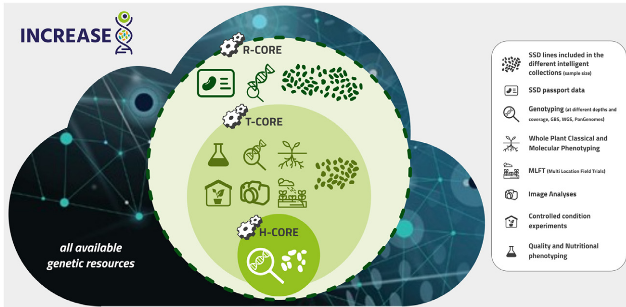
Figure 2. Schematic summary of INCREASE Intelligent Collections (ICs): Reference-CORE (R-CORE), Training-CORE (T-CORE) and Hyper-CORE (H-CORE) developed in INCREASE and activities that will be carried out on the different panels. Starting from all the available genetic resources for each of the four INCREASE legume species, R-CORE will be constituted of thousands of single-seed descent (SSD) lines, representative of the genetic resources of the species, with as complete and informative as possible passport data, and R-CORE will undergo low-coverage genotyping; T-CORE will be constituted of a subset of R-CORE (few hundreds of SSD lines) which will be involved in several phenotypic (including transcriptomic and metabolomic) and genomic characterizations (whole genome sequencing [WGS]); H-CORE, the smallest sample (about 40–50 SSD lines, based on an evolutionary transect) will be in-depth genotyped and phenotyped. All the genotypic data and information and related genomic predictions coming from the characterization of the ICs and of sub-cores of nested core collections will be the link between phenotypically evaluated and non-evaluated accessions from the universe of all available genetic resources (as far as genotyping data are available).

lines, domesticated lines not adapted to European environments and CWRs, which will be used mostly for controlled condition experiments. Thus, T-CORE phenotyping will be based on different sub-samples based on the type of experiment and the level of complexity of phenotyping (e.g., intercropping experiment using common bean and maize [ Zea mays ], drought-controlled condition experiment for chickpea and common bean, etc.);