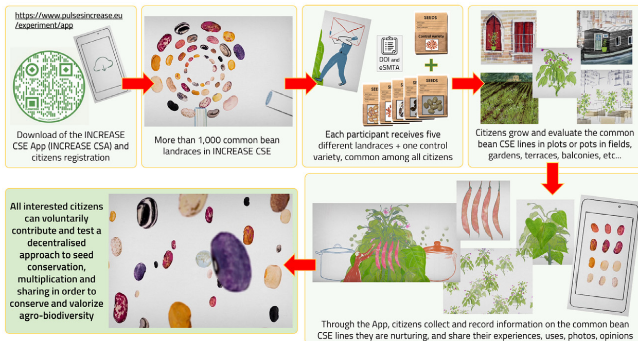
Figure 3. INCREASE citizen science experiment (CSE, illustration by Daniele Catalli). Registered CSE participants, using the expressly developed and constantly updated INCREASE CSE app, will be involved in the conservation, evaluation and valorization of the common bean genetic resources and will test the INCREASE decentralized approach to genetic resource conservation, sharing and valorization.

Moreover, within INCREASE, a citizen science experiment on common bean has recently been launched (Irwin, 2018; van Etten et al., 2019; Würschum et al., 2019; www.pulsesincrease.eu/experiment; Figure 3): external participants, throughout the registration and the use of a dedicated app (Increase CSA, Ubisive srl, from the Google Play Store or the App Store), can exploit a subset of genotypes from R-CORE (about 1000 genetically purified accessions that have been genotyped within the project BEAN_A-DAPT; ERA-CAPS 2° call, 2014) to contribute to