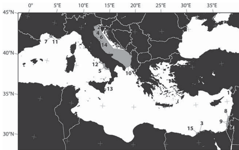
Fig. 1. Map showing the 15 previous studies on Mediterranean BF ecology used in this paper. 1. Basso and Spezzaferri, 2000; 2. Donnici and Serandrei Barbero, 2002; 3. Elshanawany et al., 2011; 4. Ernst et al., 2005; 5. Ferraro et al., 2012; 6. Frontalini et al., 2011; 7. Goineau et al., 2011; 8. Hyams-Kaphzan et al., 2008; 9. Hyams-Kaphzan et al., 2009; 10. Jorissen, 1988; 11. Mojtahid et al., 2009; 12. Romano et al., 2009; 13. Romano et al., 2013; 14. Sabbatini et al., 2012; 15. Samir and El-Din, 2001.

studies of living assemblages are still rare, and often do not include organic carbon data.